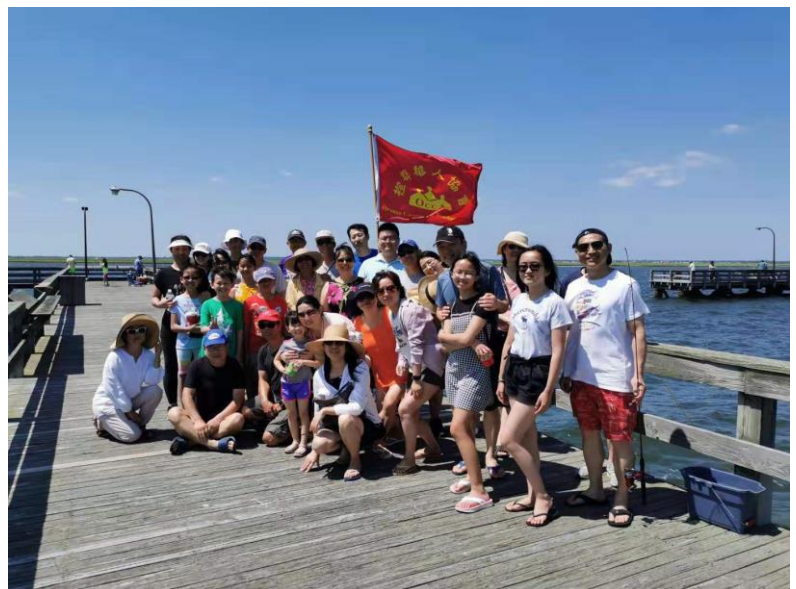
Above: OCCA visited Jones Beach on Saturday, July 13, 2019. Full article on page 8.