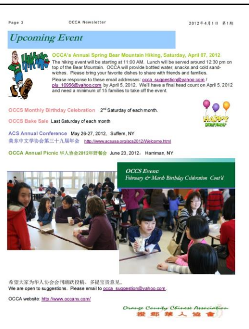
OCCA Newsletter 1st Issue (April 1, 2012)

仲夏之际得到康健会长之约，《月刊》即将刊出第 70 期，以小文作为阶段小结，当然也是鼓励和感谢继续付出时间与精力的接力人！时间往往在忙碌的时候，会被忽略，以至于我们经常是回过头来一看，时间没有了。自 2012 年刊出，寒来暑往的每一个月，《月刊》迎来第 70 期。